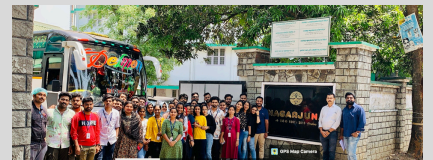
NAGARJUNA AYURVEDIC THODUPUZHA