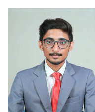
Rebin Reji Mantle Solutions