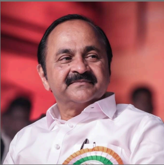
Shri V D Satheesan, Leader of Opposition, interacted with students during a session on Challenges and Opportunities of Indian Democracy.