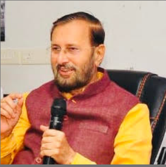
Shri Prakash Javadekar, Former Union Minister and Member of Rajyasabha, interacted with the students of MIM on Environment and NEP 2020