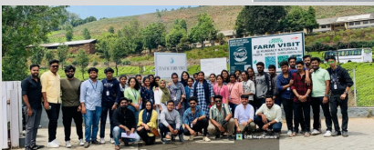
KANNAN DEVEN HILLS TEA PLANTATIONS PVT. LTD. MUNNAR