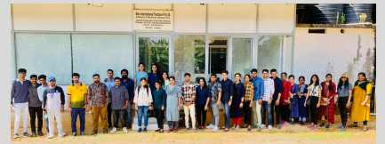
MAX INTERNATIONAL FOOTCARE PVT. LTD. WAYANAD