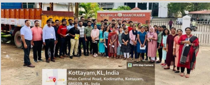
MALAYALA MANORAMA KOTTAYAM