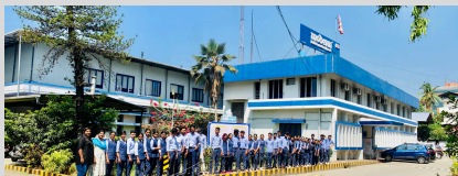
MODERN BREAD COCHIN

Here are glimpses from our recent industrial visits, where MBA students engaged with industry experts, explored corporate strategies, and networked with professionals at the forefront of business. These excursions not only broaden their horizons but also prepare them to tackle the challenges of an ever-evolving business landscape with confidence and competence.