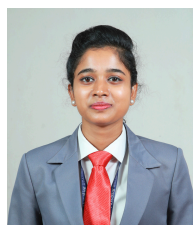
Navya Chinnu Metcon Tmt Bars