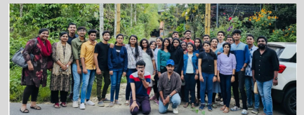
URAVU INDIGENOUS SCIENCE & TECHNOLOGY STUDY CENTRE. WAYANAD