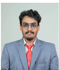
Jin G Sam Metcon Tmt Bars