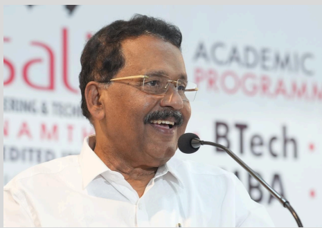
SHRI P S SREEDHARAN PILLAI Honorable Governor of Goa